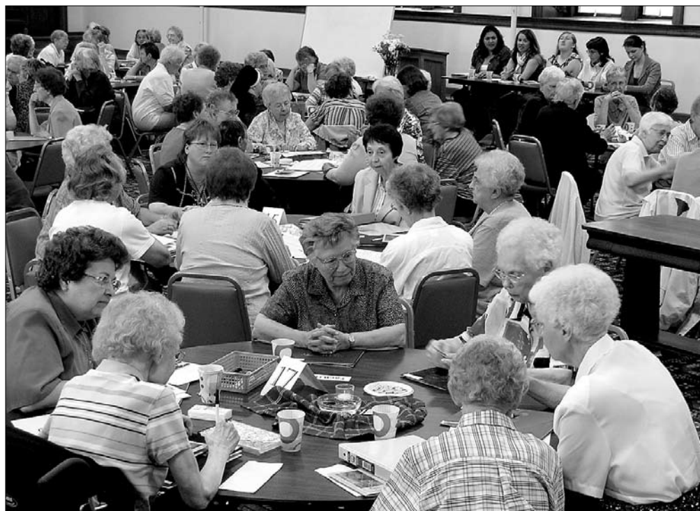
After a presentation by members of the panel, at upper right, during the June assembly, Sisters of St. Joseph discuss what has been said and prepare questions for the five young women.