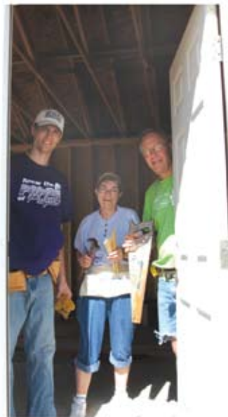
CSJ Mission Trip to Greensburg, KS Summer 2008