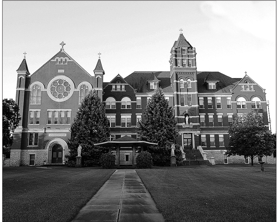
The Nazareth Motherhouse in Concordia has a lot of square feet of roof to replace. Does this remind you of Marymount?